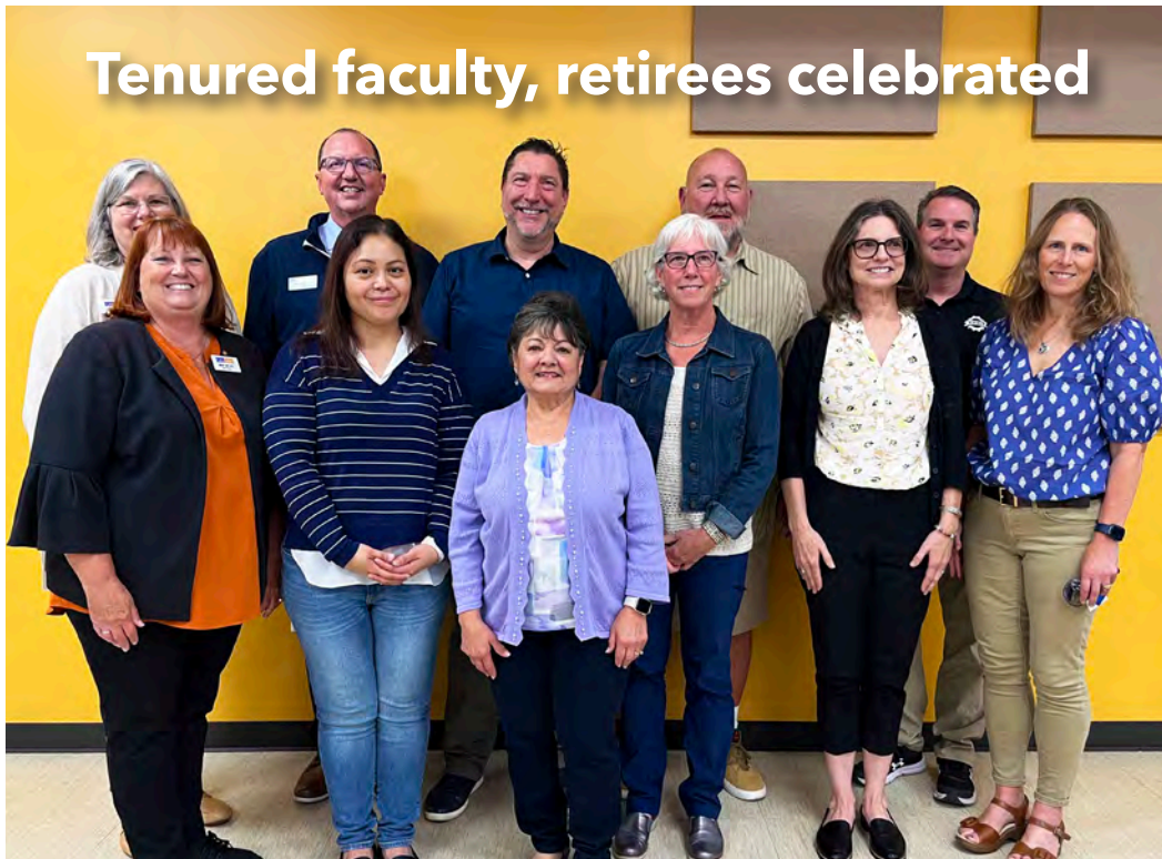
Several of this year's retirees and one tenured faculty member attended last month's reception.

Receiving tenure and concluding a long career are two significant moments in academia. Every year, Citrus College hosts a special reception to honor those individuals who have reached these professional milestones.