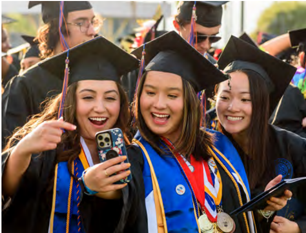
Citrus College will award more than 1,750 associate degrees during the 2024 commencement ceremony.

As the spring semester wraps up, the entire campus community is looking forward to celebrating the Class of 2024 at the 108th annual Citrus College commencement ceremony on June 14.